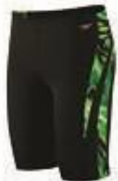
Long Swim Briefs