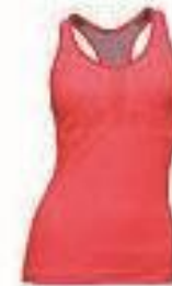
Long Sports Bra