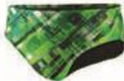
Short Swim Briefs