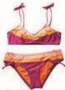
2 piece Bathing Suit