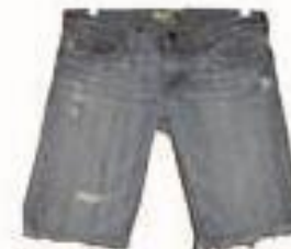
Long Cut-off Shorts