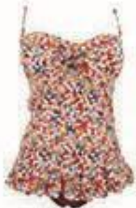
2 piece Tankini