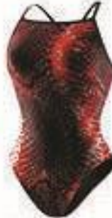
1 piece Bathing Suit