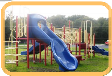
Edesville Park Playground

New Platform Tennis Courts located at Worton Park. Mini tennis courts on a raised platform. Night play under lights available, Advance reservations required. Call 410-778-1957 or email Info@KentParksAndRec.org .